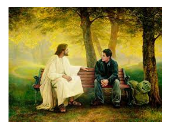
What A Friend We Have In Jesus Proverbs 18:24